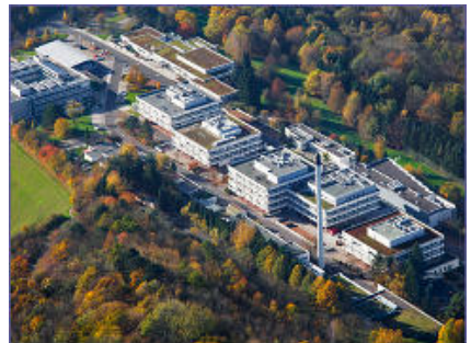
Compact CHP unit GG 402 H Compact CHP unit GG 530 Max-Planck inst. f. biophys. chemistry, Göttingen