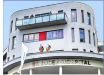
Compact CHP unit GG 260 St. Josef-Hospital Bochum