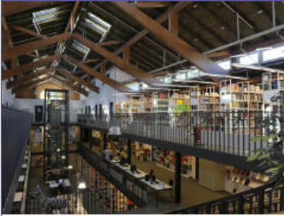
1 Compact CHP unit GG 237, 2 x GG 140, 1 x GG 50 Institute FU Berlin: Lankwitz, Düppel, Kelchstraße