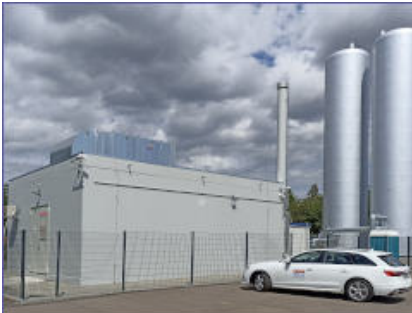
CHP unit GG 1000 District heating in Kitzscher (Saxony)