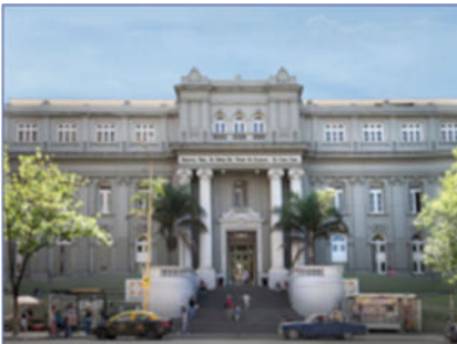
Compact CHP unit GG 50 Children's hospital, RA-Buenos Aires