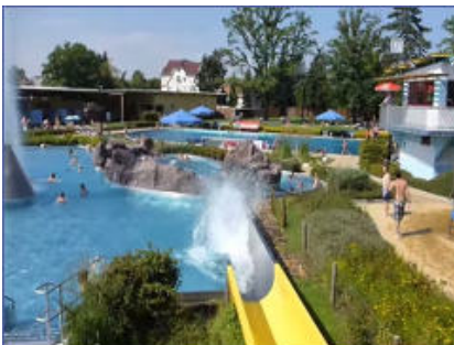
Compact CHP unit GG 260 Albgaubad Ettlingen