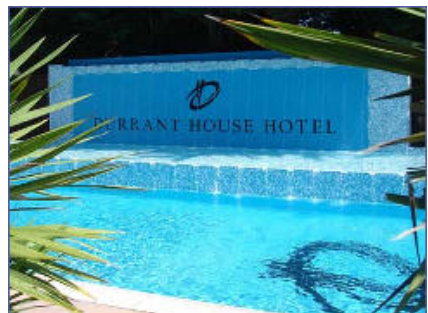
Compact CHP unit GG 50 Durrant House Hotel, UK-Northam