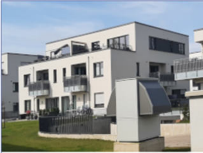
Compact CHP unit GG 50 6VRSB with air/water heat pump Housing on former NAAFI site Herford