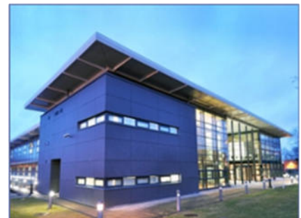
Compact CHP unit GG 113 Munster Technological University, IRL-Cork