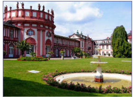
Compact CHP unit GG 50 with emergency power function Castle Biebrich, Wiesbaden