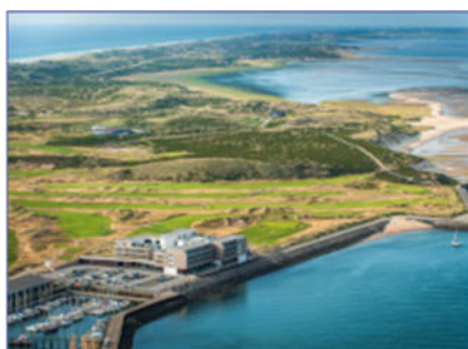
Compact CHP unit GG 70 Budersand Hotel Golf & Spa, Hörum (Sylt)

In the CHP unit type name, the first letter stands for the fuel type (G = natural gas, F = Sewage gas/biogas) and the second one for Generator. The number indicates the nominal power in kW. At special configurations, an additional letter after the number indicates the configuration: D = Steam generation, T = Thermal oil heating, H = Hot cooling (95/80 °C instead of 90/70 °C flow/return temperature). In the GK series of CHP units to generate compressed air and heat the letters stand for “Gasmotor-Kompressormodul” (gas engine compressor unit).