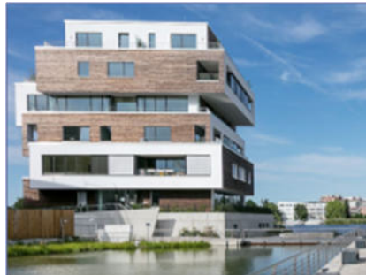
3 Compact CHP units GG 100 Housing district 52 n Nord, Berlin-Gruenau