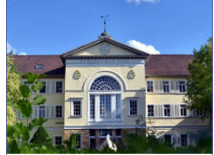
Compact CHP unit GG 237 Spa hotel, clinic and congress center Bad Boll