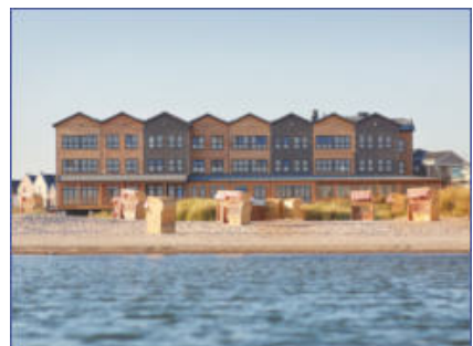
Compact CHP unit GG 70 Hotel Bretterbude ("plank shack"), Heiligenhafen Hotel building of the year 2017