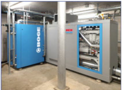
Gas engine compressor unit GK 140 for heat and compressed air generation Heckler & Koch factory, Oberndorf