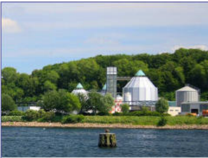
3 Compact CHP units FG 250 Water purification plant Kielseng, Flensburg