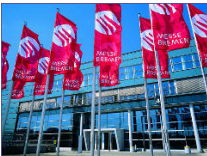
Compact CHP unit GG 50 MESSE BREMEN fairground