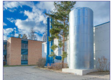
Compact CHP unit GG 237 with emergency power function VEM Motors GmbH, Wernigerode