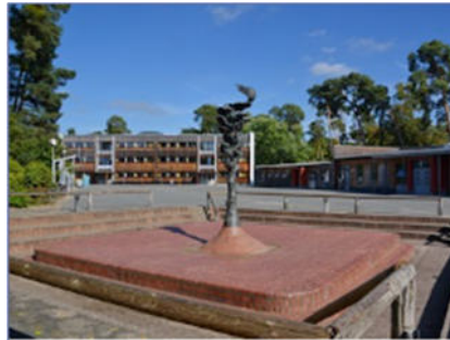
Compact CHP unit GG 50 School village Bergstrasse, Seeheim-Jugenheim