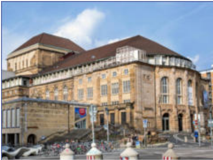
Compact CHP unit GG 330 City theatre Freiburg