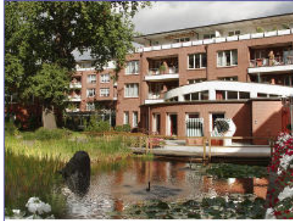
Compact CHP unit GG 50 Pakresidenz Rahlstedt, Hamburg Residence for senior citizens