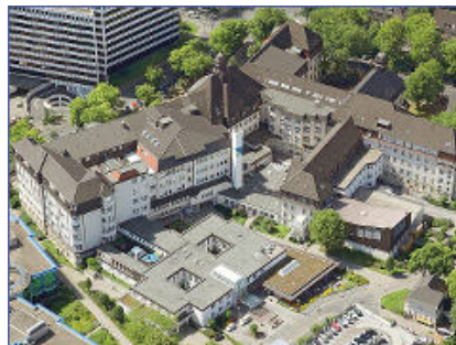
Compact CHP unit GG 402 Elisabeth hospital Essen