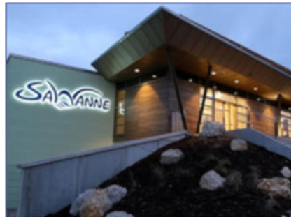
Compact CHP unit GG 50 Swimming pool & Spa SaWanne, Sangerhausen