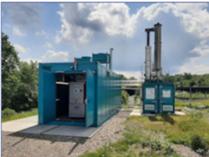
Compact CHP unit FG 95 Landfill Reesberg, Kirchlegern