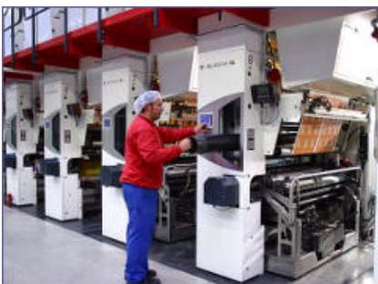
Compact CHP unit GG 402 T Gravure printing plant, Rahning, Bünde