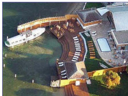
Compact CHP unit GG 50 monte mare lake sauna, Tegernsee