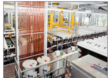
3 Compact CHP units GG 140 Rohde AG industrial handles, Noerten-Hardenberg CHP scheme of the year 2014