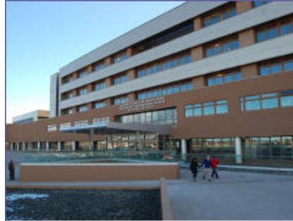
Compact CHP unit GG 402 Hospital Clinico de Magallanes Punta Arenas, Chile