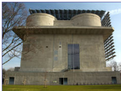
Compact CHP unit GG 530 Compact CHP unit GG 237 Energiebunker Hamburg-Wilhelmsburg