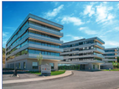
Compact CHP unit GG 100 in Container with emergency power and cooling Company HQ building 'The SUMMIT', Siegen