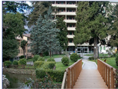
Compact CHP unit GG 140 Retirement home Istituti Riuniti Airoldi e Muzzi, I-Lecco