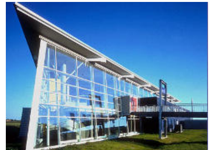
BHKW-Kompaktmodul GG 70 H with absorption chiller for climatization Multimar Wattforum, Tönning