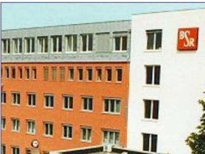
Compact CHP unit GG 237 H Berliner Stadtreinigung BSR