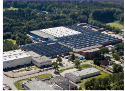
1 Compact CHP unit GG 402 1 Compact CHP unit GG 402 H GRUNDFOS Pumpenfabrik GmbH, Wahlstedt