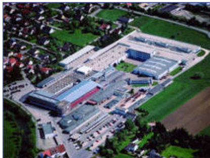
2 Compact CHP units GG 237 with emergency power function Röhm GmbH, Sontheim