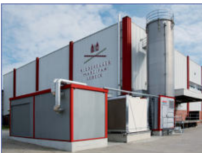
Compact CHP unit GG 402 H with hot cooling for trigeneration, container J.G. NIEDEREGGER GmbH & Co. KG, Lübeck