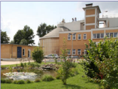
Compact CHP unit FG 250 Container installation Water purification plant Herford