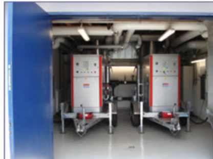
2 Compact CHP units GG 50 mobile Outdoors pool in summer and school in Winter, Enkenbach-Alsenborn