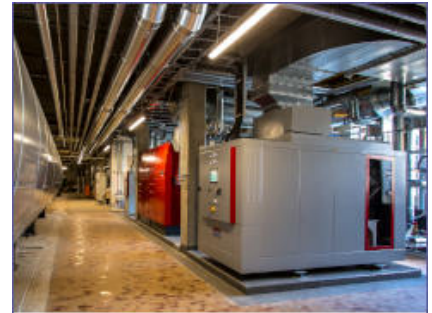
Compact CHP unit GG 260 H Compact CHP unit GG 100 H School and administration center Ravensburg