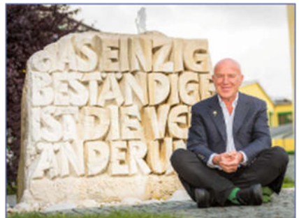
Compact CHP unit GG 140 Organic food production, RAPUNZEL, Legau