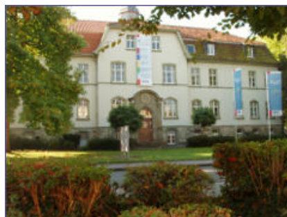
2 Compact CHP units GG 140 LWL-Klinik Lippstadt