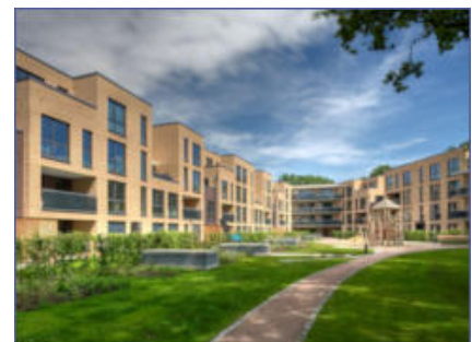
Compact CHP unit GG 260 Residential area Poppenbuetteler Berg, Hamburg