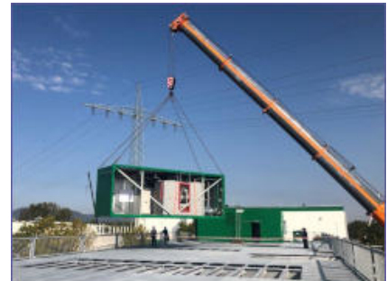
2 Compact CHP units GG 530 H with SCR catalyst, APL Landau