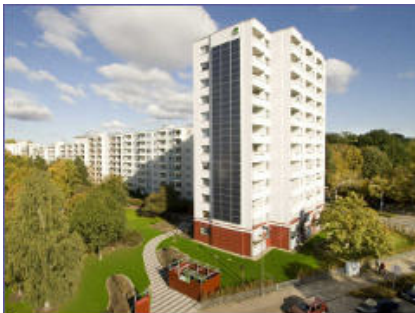
Compact CHP unit GG 140 Residential complex, Hannover-Laatzten