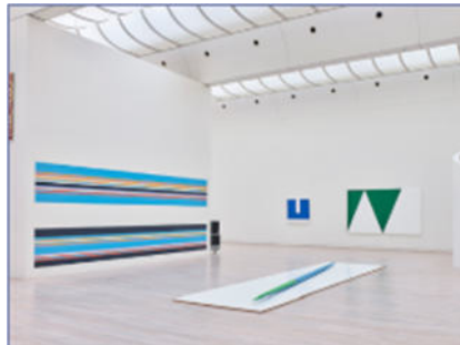
Compact CHP unit GG 140 Arts collection NRW (K20), Duesseldorf