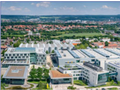
4 Compact CHP units GG 402, 1 x GG 206, 1 x GG 395 Sartorius Campus Göttingen