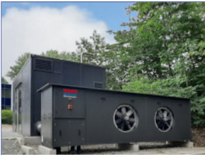
Compact CHP unit GG 50 6VRSB P Air-water heat pump 75 kWth District heating and head office Hiddenhausen