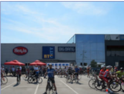
Compact CHP unit GG 50 Shopping center BTC City, SLO-Murska Sobota