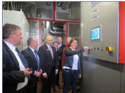
Compact CHP unit GG 530 with additional enclosure Thiebauth school Ettlingen