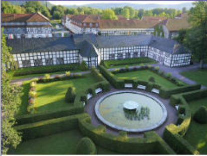
2 Compact CHP units GG 237 1 Compact CHP unit GG 140 Gräflicher Park Hotel & Spa, Bad Driburg