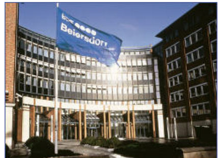
2 Compact CHP units GG 237 1 Compact CHP unit GG 140 Beiersdorf AG factories, Hamburg