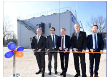
Compact CHP unit GG 330 + GG 260 EnBW combined energy center Waldbronn Contracting Award 2018