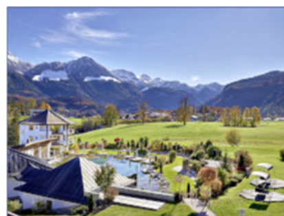
3 Compact CHP units GG 50 6VRSB Alpenhotel Zechmeisterlehen, Schoenau