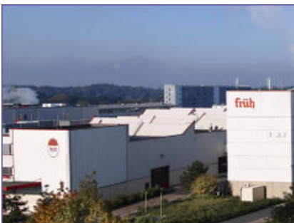
Compact CHP unit GG 198 D Brewery Cölner Hofbräu Früh KG, Cologne