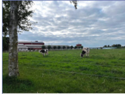
Compact CHP unit FG 123 Biogas plant in Glumslöv, Sweden