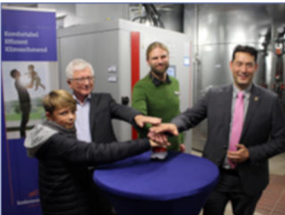
Compact CHP unit GG 260 Heat and power plant Seidenfaeden, Denzlingen