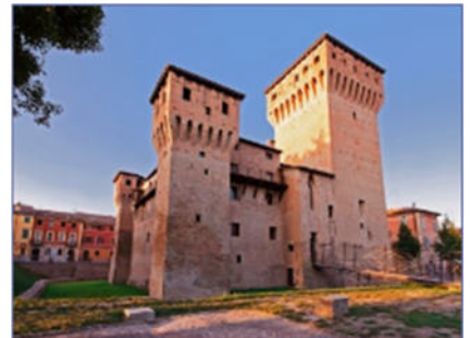
Compact CHP unit GG 530 District heating, I-San Felice sul Panaro