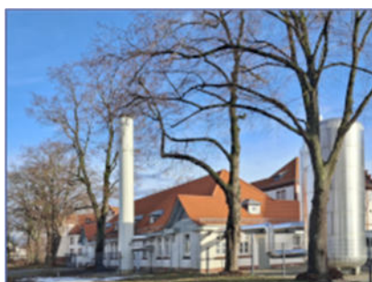
Compact CHP unit GG 202 with brine/water and air/water heat pump Alanbrooke Quartier Paderborn