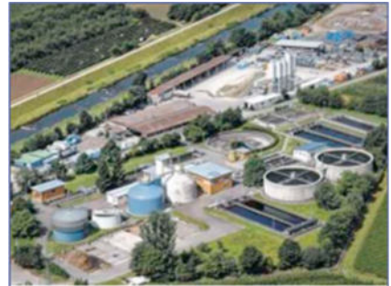
2 Compact CHP units FG 50 with emergency power function Water purification plant, Oberkirch