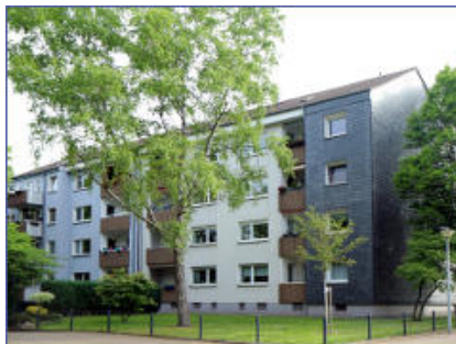
Compact CHP unit GG 530 Flexible cogeneration with electric boiler District heating Oberhausen-Barmingholten