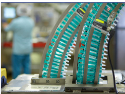
2 Compact CHP units GG 402 H with absorption chiller Injection production, ALMO, Bad Arolsen