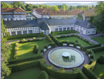
2 Compact CHP units GG 237 1 Compact CHP unit GG 140 Gräflicher Park Hotel & Spa, Bad Driburg