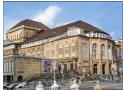
Compact CHP unit GG 330 City theatre Freiburg