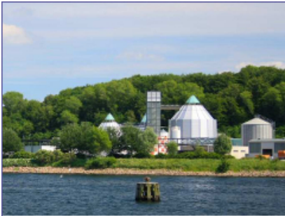
3 Compact CHP units FG 250 Water purification plant Kielseng, Flensburg