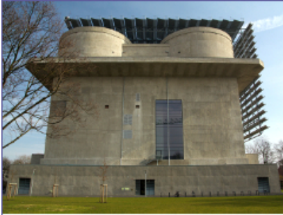
Compact CHP unit GG 530 Compact CHP unit GG 237 Energiebunker Hamburg-Wilhelmsburg