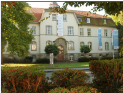
2 Compact CHP units GG 140 LWL-Klinik Lippstadt