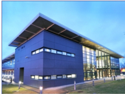
Compact CHP unit GG 50 Compact CHP unit GG 113 Cork Institute of Technology CIT, Cork (Ireland)