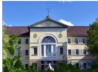
Compact CHP unit GG 237 Spa hotel, clinic and congress center Bad Boll