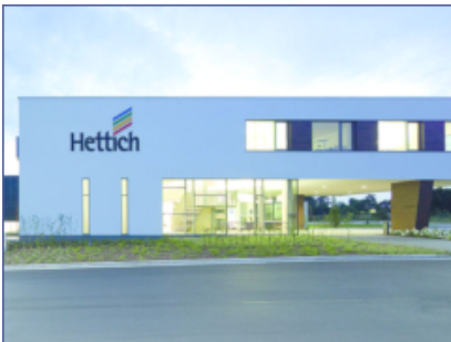
3 Compact CHP units GG 50 Furniture parts production, Hettich, Kirchlegern