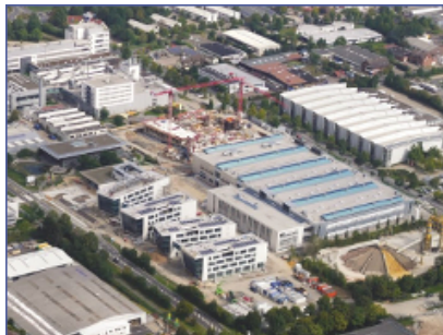
4 Compact CHP units GG 402 1 Compact CHP unit GG 206 Sartorius Campus Göttingen