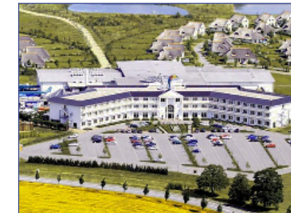
3 Compact CHP units GG 237 with emergency power function Van der Valk Resort Linstow