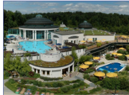
Compact CHP unit GG 113 Compact CHP unit GG 140 Mineraltherme Böblingen