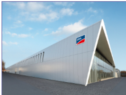
Compact CHP unit GG 237 H SMA Solar Technology AG, Kassel