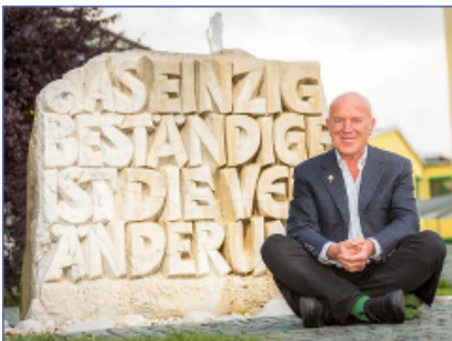
Compact CHP unit GG 140 Organic food production, RAPUNZEL, Legau