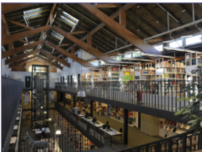
Compact CHP units GG 140 1 CHP type GG 237, 1 CHP type GG 50 FU Berlin, Düppel / Lankwitz / Kelchstraße