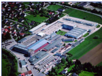
2 Compact CHP units GG 237 with emergency power function Röhm GmbH, Sontheim