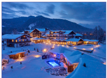
Compact CHP unit GG 70 Compact CHP unit GG 50 Alpenhotel Zechmeisterlehen, Schönaun