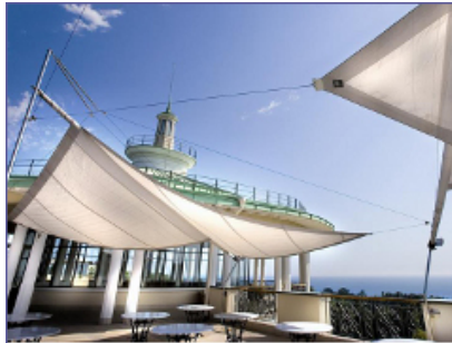
3 Compact CHP units GG 240 with emergency power function Hotel Rodina, Sochi (Russia)