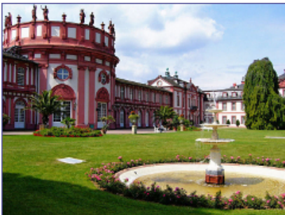
Compact CHP unit GG 50 with emergency power function Castle Biebrich, Wiesbaden