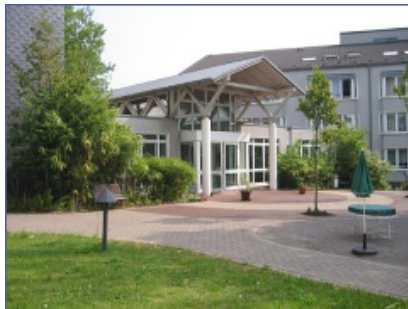
Compact CHP unit GG 50 Retirement home, Bochum-Weitmar