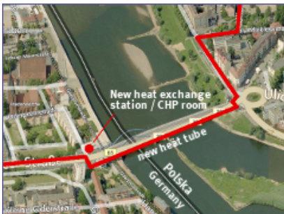
Compact CHP unit GG 50 H for border-crossing mutual heat supply Heat exchange station, Frankfurt (Oder)