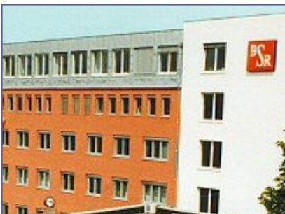
Compact CHP unit GG 237 H Berliner Stadtreinigung BSR