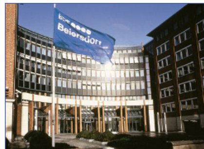
2 Compact CHP units GG 237 1 Compact CHP unit GG 140 Beiersdorf AG factories, Hamburg