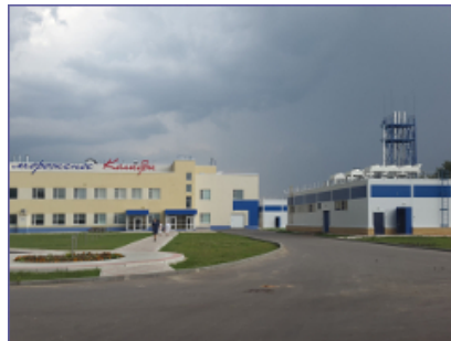
3 Compact CHP units GG 402 for the power supply independent of the mains Ice cream plant Kolibri, RUS-Nishny Novgorod