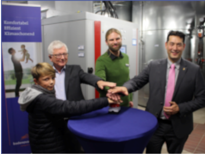
Compact CHP unit GG 260 Heat and power plant Seidenfaeden, Denzlingen