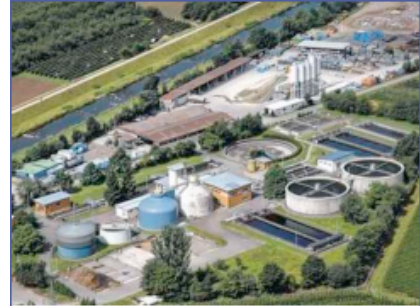
2 Compact CHP units FG 50 with emergency power function Water purification plant, Oberkirch