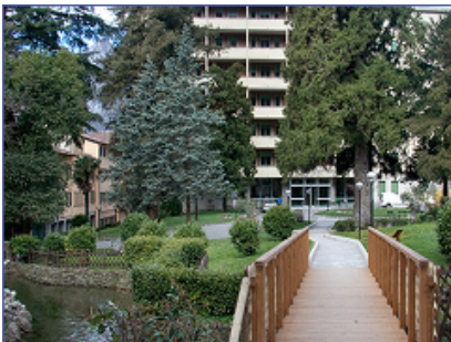
Compact CHP unit GG 140 Retirement home Istituti Riuniti Airoidi e Muzzi, I-Lecco