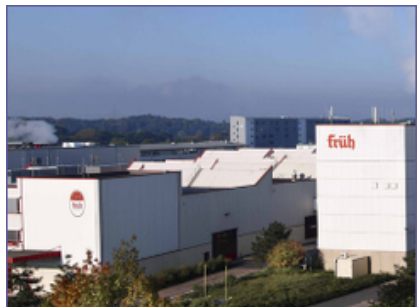
Compact CHP unit GG 198 D Brewery Kölner Hofbräu Früh KG, Cologne