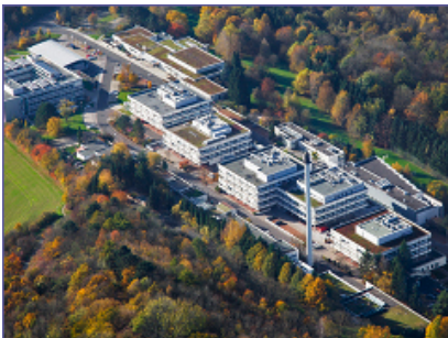
Compact CHP unit GG 402 H Compact CHP unit GG 530 Max-Planck inst. f. biophys. chemistry, Göttingen