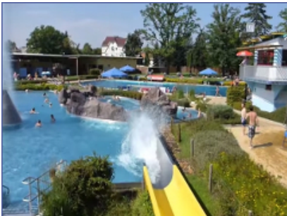
Compact CHP unit GG 260 Albgaubad Ettlingen