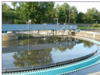
2 Compact CHP units FG 123 installed in container Water purification plant Fellbach