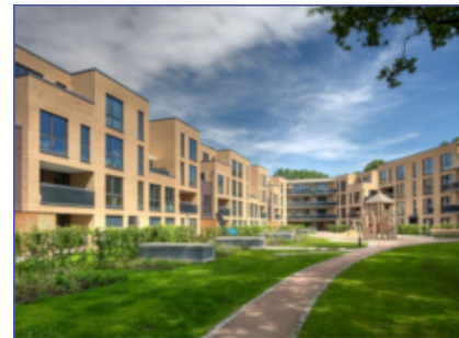
Compact CHP unit GG 260 Residential area Poppenbuetterer Berg, Hamburg