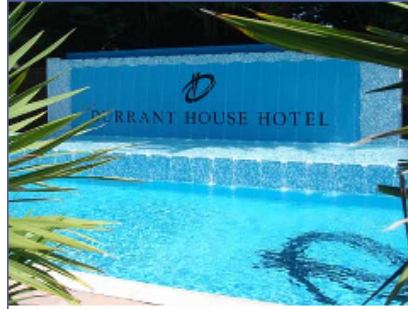
Compact CHP unit GG 50 Durrant House Hotel, UK-Northam