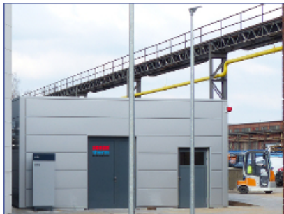
Compact CHP unit GG 260 CHP demonstration plant with field test engine MAN Bus & Truck AG, engine plant Nuernberg