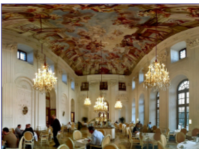
Compact CHP unit GG 50 Maritim Hotel am Schlossgarten Fulda