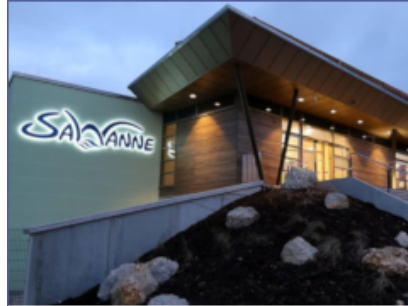
Compact CHP unit GG 50 Swimming pool & Spa SaWanne, Sangerhausen