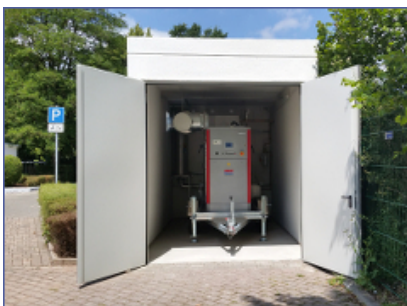
Compact CHP unit GG 50 mobile Outdoors pool in summer and school in winter; Waldmohr