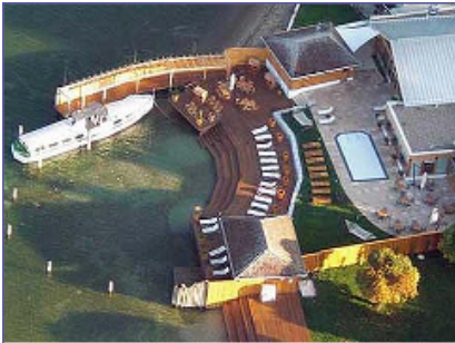
Compact CHP unit GG 50 monte mare lake sauna, Tegernsee