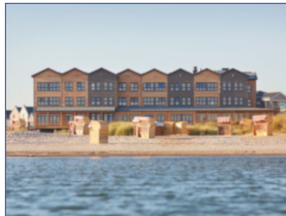
Compact CHP unit GG 70 Hotel Bretterbude ("plank shack"), Heiligenhafen Hotel building of the year 2017