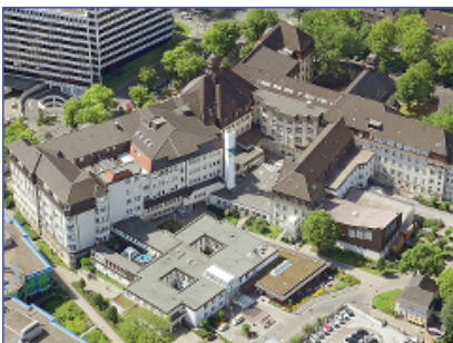
Compact CHP unit GG 402 Elisabeth hospital Essen