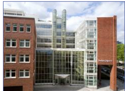
Compact CHP unit GG 140 Frankfurter Allgemeine Zeitung (F.A.Z.) Newspaper publishing house, Frankfurt