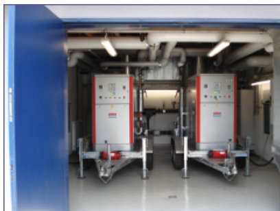
2 Compact CHP units GG 50 mobile Outdoors pool in summer and school in Winter, Enkenbach-Alsenborn