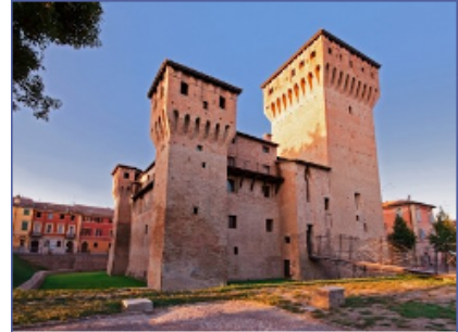
Compact CHP unit GG 530 District heating, I-San Felice sul Panaro