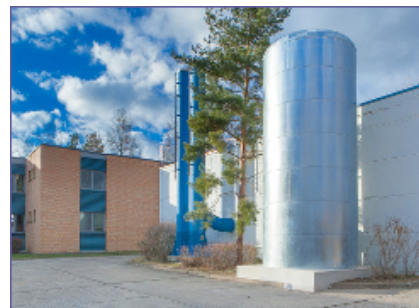
Compact CHP unit GG 237 with emergency power function VEM Motors GmbH, Wernigerode