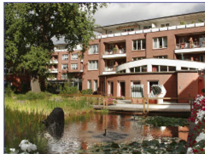
Compact CHP unit GG 50 Parkresidenz Rahlstedt, Hamburg Residence for senior citizens