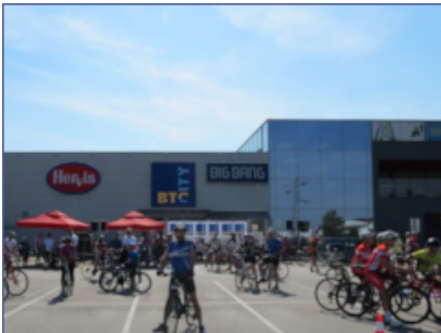
Compact CHP unit GG 50 Shopping center BTC City, SLO-Murska Sobota