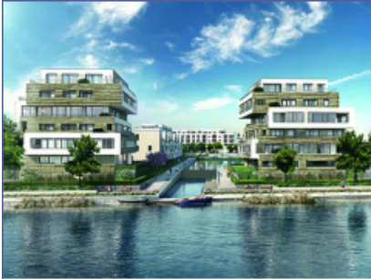
2 Compact CHP units GG 100 Housing development "52° Nord", Berlin