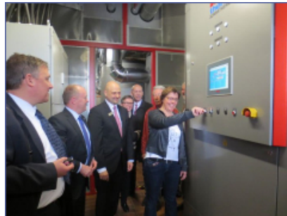
Compact CHP unit GG 530 with additional enclosure Thiebauth school Ettlingen