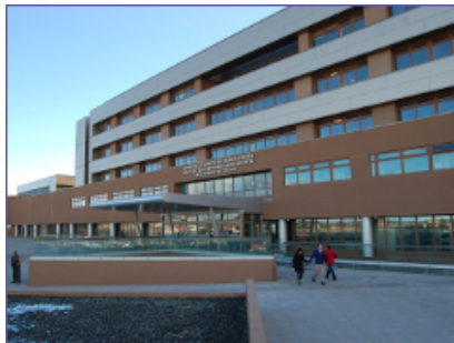
Compact CHP unit GG 402 Hospital Clinico de Magallanes Punta Arenas, Chile