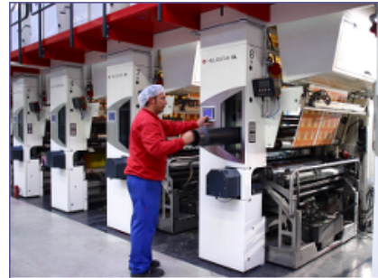
Compact CHP unit GG 402 T Gravure printing plant, Rahning, Bünde