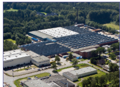
1 Compact CHP unit GG 402 1 Compact CHP unit GG 402 H GRUNDFOS Pumpenfabrik GmbH, Wahlstedt