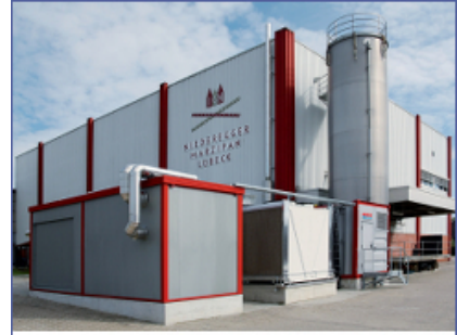
Compact CHP unit GG 402 H with hot cooling for trigeneration, container J.G. NIEDEREGGER GmbH & Co. KG, Lübeck