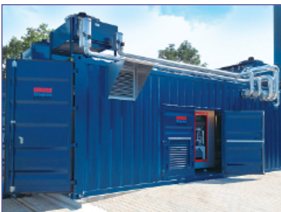
2 Compact CHP units FG 250 Water purification plant Herford