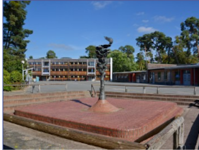
Compact CHP unit GG 50 School village Bergstrasse, Seeheim-Jugenheim