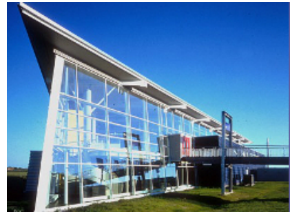
Compact CHP unit GG 50 H with absorption chiller for climatisation Multimar Wattforum, Tönning