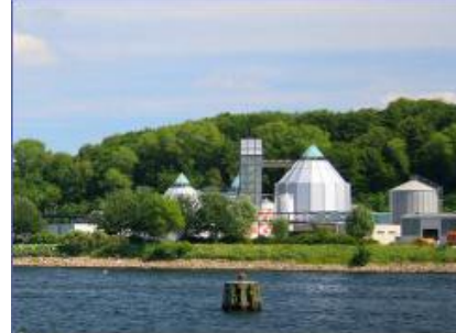
3 Compact CHP units FG 250 Water purification plant Kielseng, Flensburg