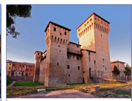
Compact CHP unit GG 530 District heating, I-San Felice sul Panaro