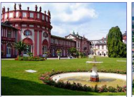
Compact CHP unit GG 50 with emergency power function Castle Biebrich, Wiesbaden