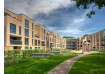
Compact CHP unit GG 260 Residential area Poppenbuetteler Berg, Hamburg