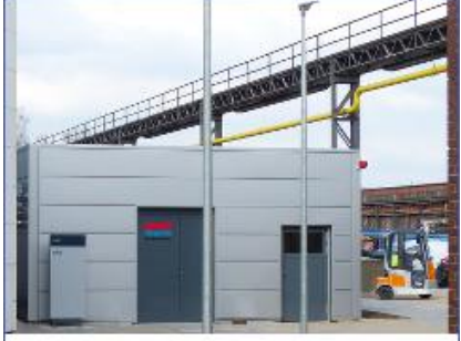
Compact CHP unit GG 260 CHP demonstration plant with field test engine MAN Bus & Truck AG, engine plant Nuermberg