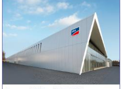
Compact CHP unit GG 237 H SMA Solar Technology AG, Kassel