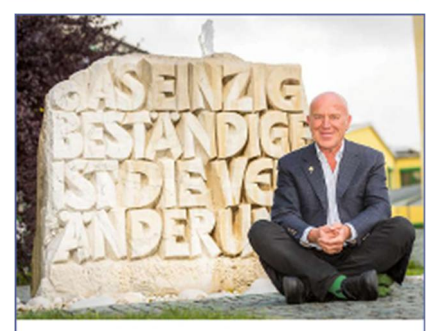
Compact CHP unit GG 140 Organic food production, RAPUNZEL, Legau