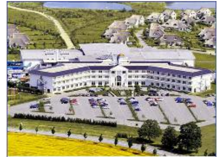
3 Compact CHP units GG 237 with emergency power function Van der Valk Resort Linstow