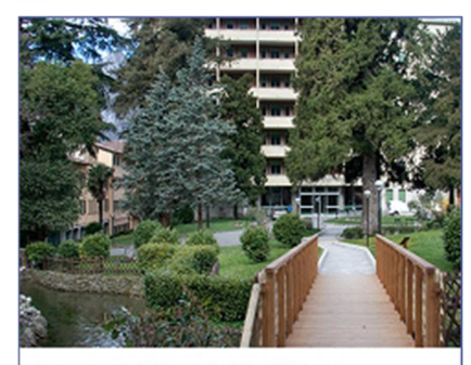
Compact CHP unit GG 140 Retirement home Istituti Riuniti Airoldi e Muzzi, I-Lecco