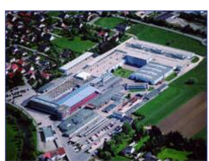
2 Compact CHP units GG 237 with emergency power function Röhm GmbH, Sontheim