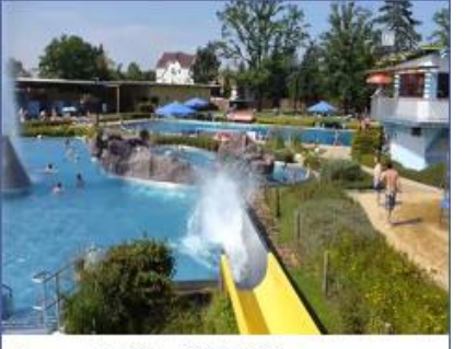
Compact CHP unit GG 260 Albgaubad Ettlingen