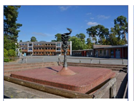
Compact CHP unit GG 50 School village Bergstrasse, Seeheim-Jugenheim