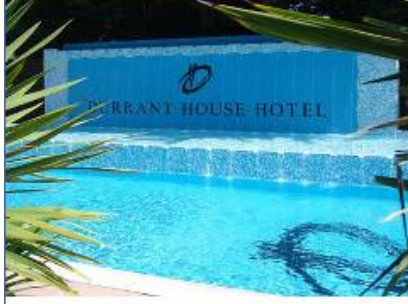
Compact CHP unit GG 50 Durrant House Hotel, UK-Northam