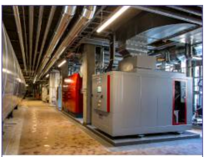
Compact CHP unit GG 260 H Compact CHP unit GG 100 H School and administration center Ravensburg