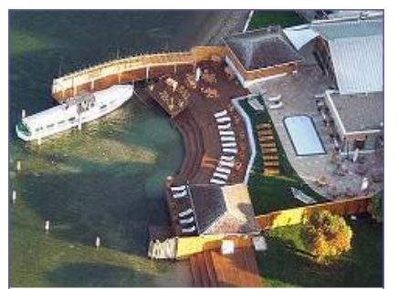
Compact CHP unit GG 50 monte mare lake sauna, Tegernsee