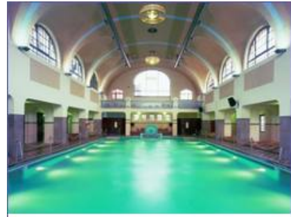
Compact CHP unit GG 140 Badehaus Nordhausen