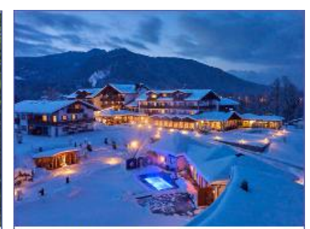
Compact CHP unit GG 70 Compact CHP unit GG 50 Alpenhotel Zechmeisterlehen, Schönau