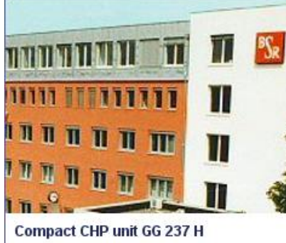
Compact CHP unit GG 237 H Berliner Stadtreinigung BSR