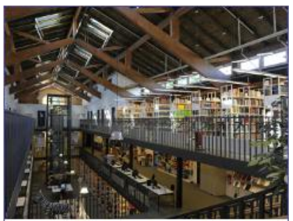
1 Compact CHP unit GG 237, 2 x GG 140, 1 x GG 50 Institute FU Berlin: Lankwitz, Düppel, Kelchstraße