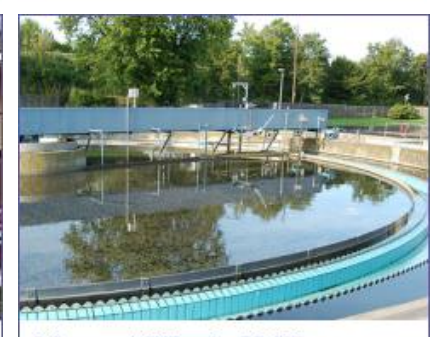
2 Compact CHP units FG 123 installed in container Water purification plant Fellbach