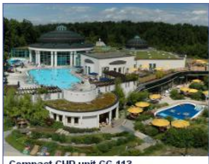
Compact CHP unit GG 113 Compact CHP unit GG 140 Mineraltherme Böblingen