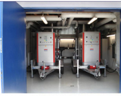
2 Compact CHP units GG 50 mobile Outdoors pool in summer and school in Winter, Enkenbach-Alsenborn