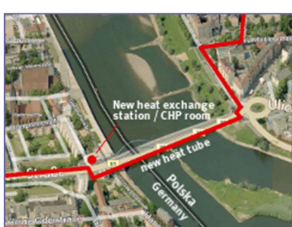
Compact CHP unit GG 50 H for border-crossing mutual heat supply Heat exchange station, Frankfurt (Oder)