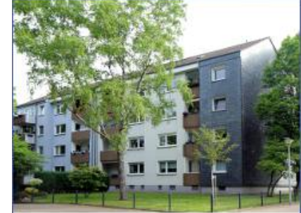
Compact CHP unit GG 530 Flexible cogeneration with electric boiler District heating Oberhausen-Barmingholten