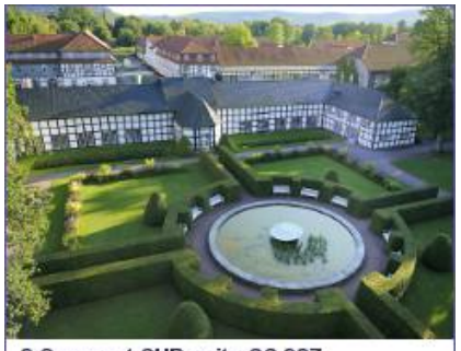
2 Compact CHP units GG 237 1 Compact CHP unit GG 140 Gräflicher Park Hotel & Spa, Bad Driburg